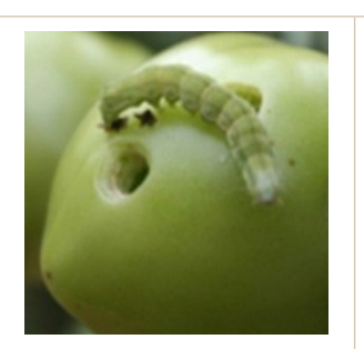
Bollworm larvae are much larger; this one is feeding on a tomato fruit