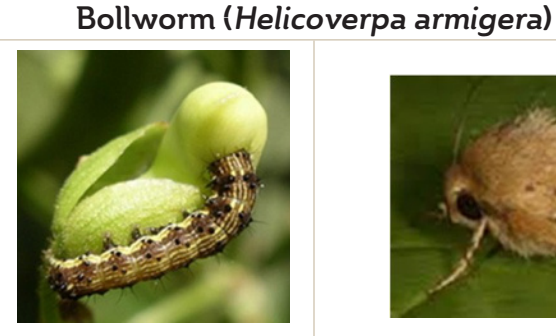
Larvae vary in colour; this one is feeding on a flower