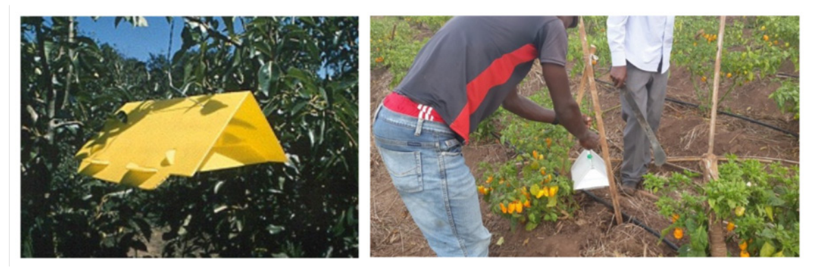
Figure 1: Examples of traps used to monitor FCM populations

Infestation levels vary greatly from season to season, and it is important to know if adult moths are in the area so that preventive measures can be carried out and control can be prepared. Fallen fruit are particularly important in assessing populations of FCM within the crop. After opening fruit to check for larvae, they must be destroyed to prevent any larvae from pupating and emerging as adult moths. This can be done by burning or burying to a depth of 60–90 cm.