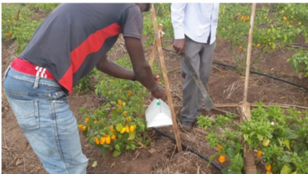
Figure 1: Examples of traps used to monitor FCM populations

Procedures to be followed by companies when there is an FCM Alert should be discussed and validated with the competent authorities.