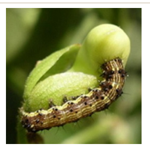
Larvae vary in colour; this one is feeding on a flower