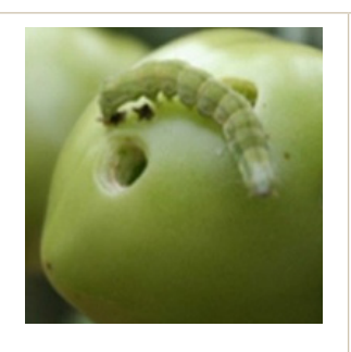
Bollworm larvae are much larger; this one is feeding on a tomato fruit