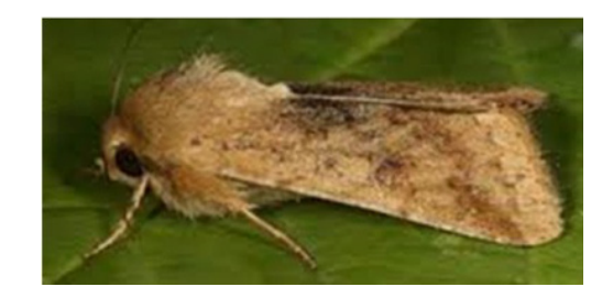
Adult bollworm moths are 12-20 mm long